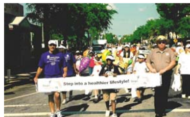
Festival of States Parade

Steps to A Healthier Florida-Pinellas County is a federally funded grant program. This five year project focuses on delivering important health messages regarding obesity, diabetes, asthma and related behavior including nutrition, physical activity and tobacco usage. Our goal is to reduce the occurrence of these behavioral diseases that have been shown to lead to heart disease, Type 2 Diabetes, certain forms of cancer, high blood pressure, and other life threatening health conditions.